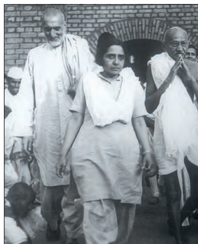
Fig. 21 – Khan Abdul Ghaffar Khan, the Pashtun leader from the North West Frontier Province, with his colleagues at a peace march through Bihar, March 1947

Election districts with no reservations for any religious or other community