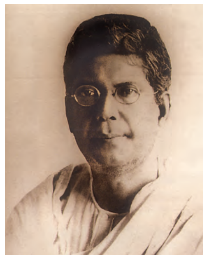
Fig. 9 – Chitta Ranjan Das A major figure in the freedom movement, Das was a lawyer from East Bengal. He was especially active in the Non-Cooperation Movement.

Two important developments of the mid-1920s were the formation of the Rashtriya Swayamsevak Sangh (RSS), a Hindu organisation, and the Communist Party of India. These parties have held very different ideas about the kind of country India should be. Find out about their ideas with the help of your teacher. The revolutionary nationalist Bhagat Singh too was active in this period.