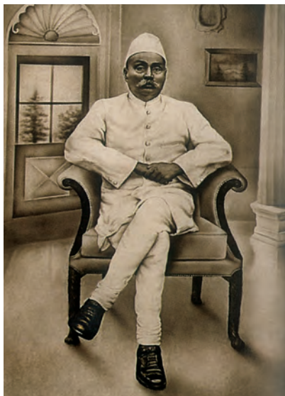
Fig. 5 – Lala Lajpat Rai

A nationalist from Punjab, he was one of the leading members of the Radical group which was critical of the politics of petitions. He was also an active member of the Arya Samaj.