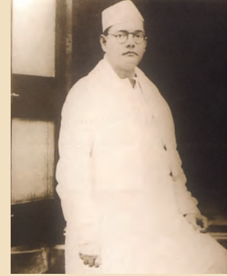
Fig. 15 – Subhas Chandra Bose

A radical nationalist, with socialist leanings, Bose did not share Gandhiji’s ideal of ahimsa , though he respected him as the “Father of the