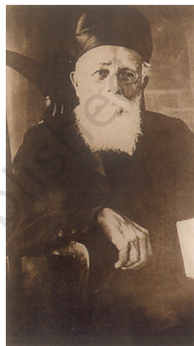
Fig. 2 – Dadabhai Naoroji Naoroji's book Poverty and Un-British Rule in India offered a scathing criticism of the economic impact of British rule.

this Congress is composed of the representatives, not of any one class or community of India, but of all the different communities of India.