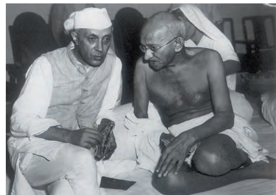
Fig. 16 – Jawaharlal Nehru listens to Mahatma Gandhi before the Bombay session of the Congress, July 1946

Nation”. In January 1941, he secretly left his Calcutta home, went to Singapore, via Germany, and raised the Azad Hind Fauj or the Indian National Army (INA). To free India from British control, in 1944, the INA tried to enter India through Imphal and Kohima but the campaign failed. The INA members were imprisoned and tried. People across the country, from all walks of life, participated in the movement against the INA trials.