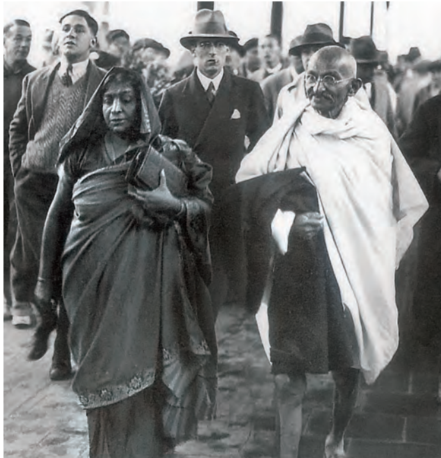
Fig. 13 – Sarojini Naidu with Mahatma Gandhi, Paris, 1931

Active in the national movement since the early 1920s, Naidu was a significant leader of the Dandi March. She was the first Indian woman to become President of the Indian National Congress (1925).