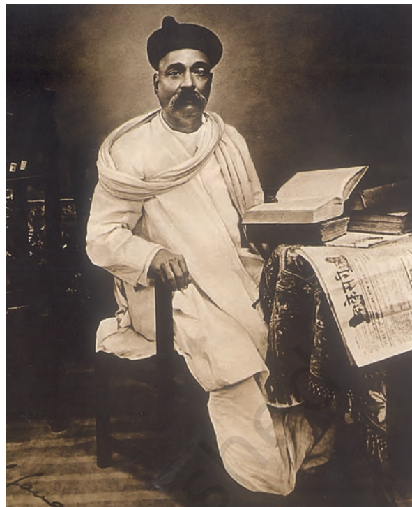
Fig. 3 – Balgangadhar Tilak

The partition of Bengal infuriated people all over India. All sections of the Congress – the Moderates and the Radicals, as they may be called – opposed it. Large public meetings and demonstrations were organised and novel methods of mass protest developed. The struggle that unfolded came to be known as the Swadeshi movement, strongest in Bengal but with echoes elsewhere too – in deltaic Andhra for instance, it was known as the Vandemataram Movement.