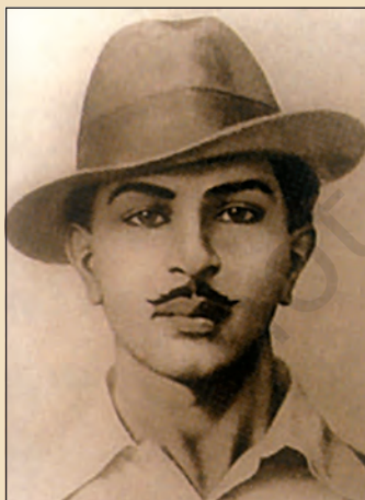
Fig. 11 – Bhagat Singh

The decade closed with the Congress resolving to fight for Purna Swaraj (complete independence) in 1929 under the presidency of Jawaharlal Nehru. Consequently, "Independence Day" was observed on 26 January 1930 all over the country.