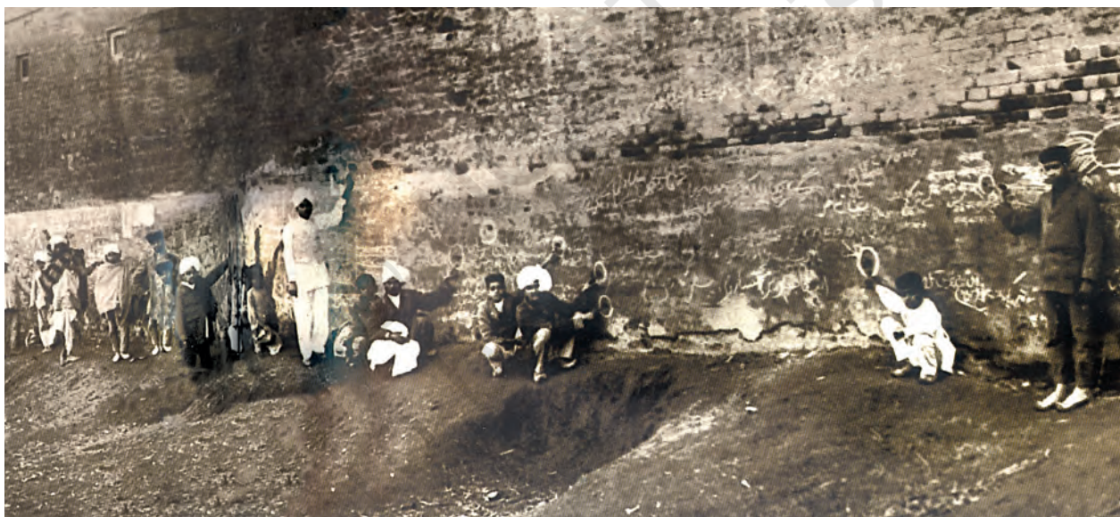
Fig. 7 – The walled compound in which General Dyer opened fire on a gathering of people

Find out about the Jallianwala Bagh massacre. What is Jallianwala Bagh? What atrocities were committed there? How were they committed?