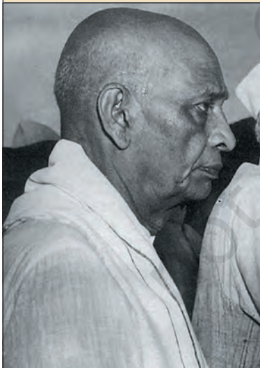
Fig. 19 – Sardar Vallabhbhai Patel played an important role in the negotiations for independence during 1945–47

Patel hailed from an impoverished peasant-proprietor family of Nadiad, Gujarat. A foremost organiser of the freedom movement from 1918 onwards, Patel served as President of the Congress in 1931.