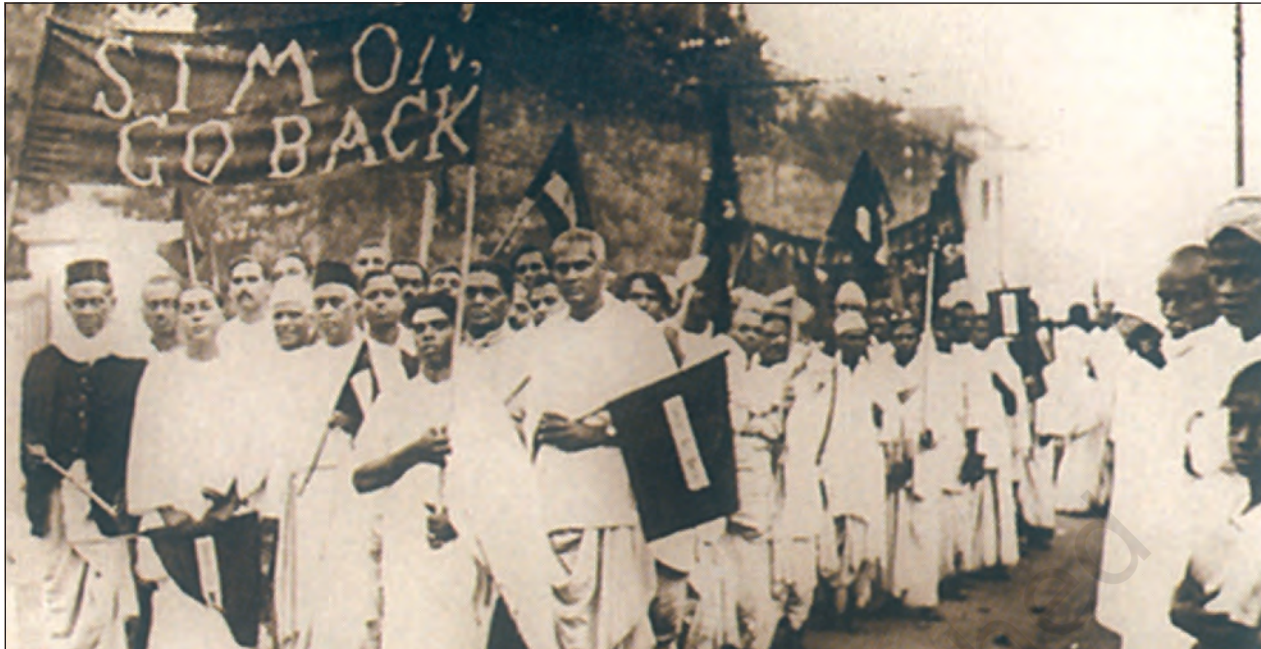
Fig. 10 – Demonstrators oppose the Simon Commission

In 1927, the British government in England decided to send a commission headed by Lord Simon to decide India's political future. The Commission had no Indian representative. The decision created an outrage in India. All political groups decided to boycott the Commission. When the Commission arrived, it was met with demonstrations with banners saying "Simon Go Back".