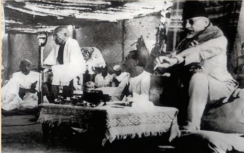
Fig. 17 – Maulana Azad with other members at the Congress Working Committee, Sevagram, 1942

Azad was born in Mecca to a Bengali father and an Arab mother. Well-versed in many languages, Azad was a scholar of Islam and an exponent of the notion of wahadat-i-deen , the essential oneness of all religions. An active participant in Gandhian movements and a staunch advocate of Hindu-Muslim unity, he was opposed to Jinnah's two-nation theory.