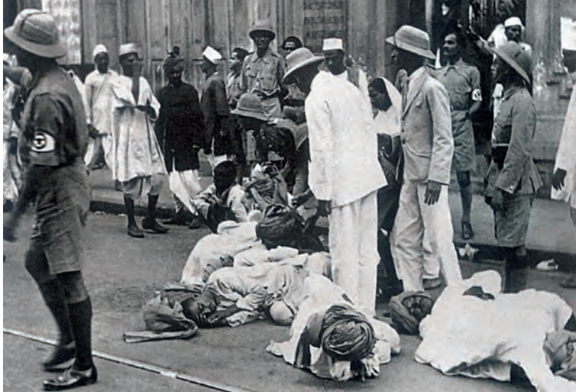
Fig. 14 – Quit India movement, August 1942

Demonstrators clashed with the police everywhere. Many thousands were arrested, over a thousand killed, many more were injured.