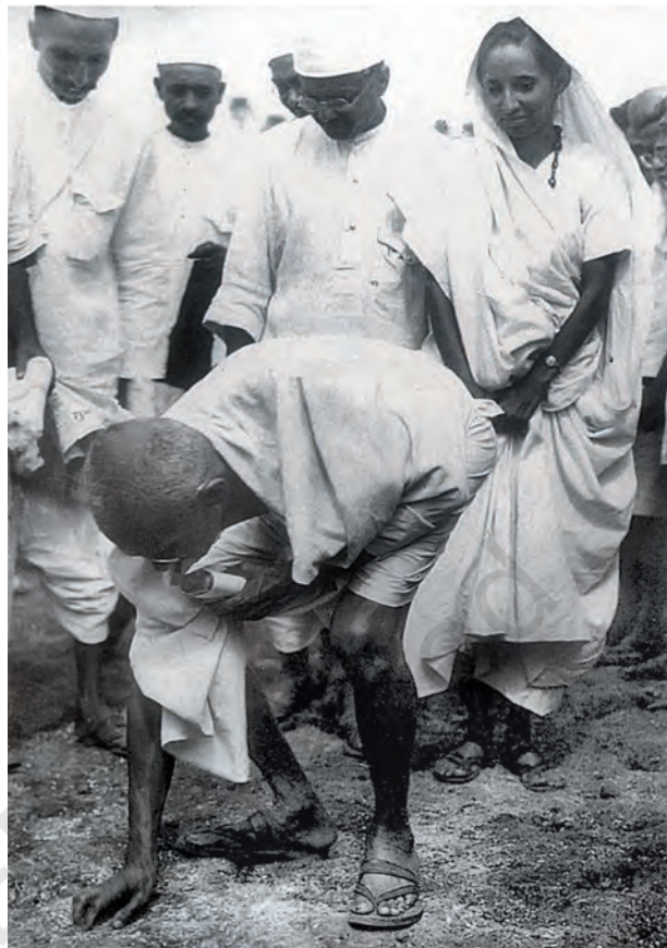
Fig. 12 – Mahatma Gandhi breaking the salt law by picking up a lump of natural salt, Dandi, 6 April 1930

Gandhiji and his followers marched for over 240 miles from Sabarmati to the coastal town of Dandi where they broke the government law by gathering natural salt found on the seashore, and boiling sea water to produce salt.