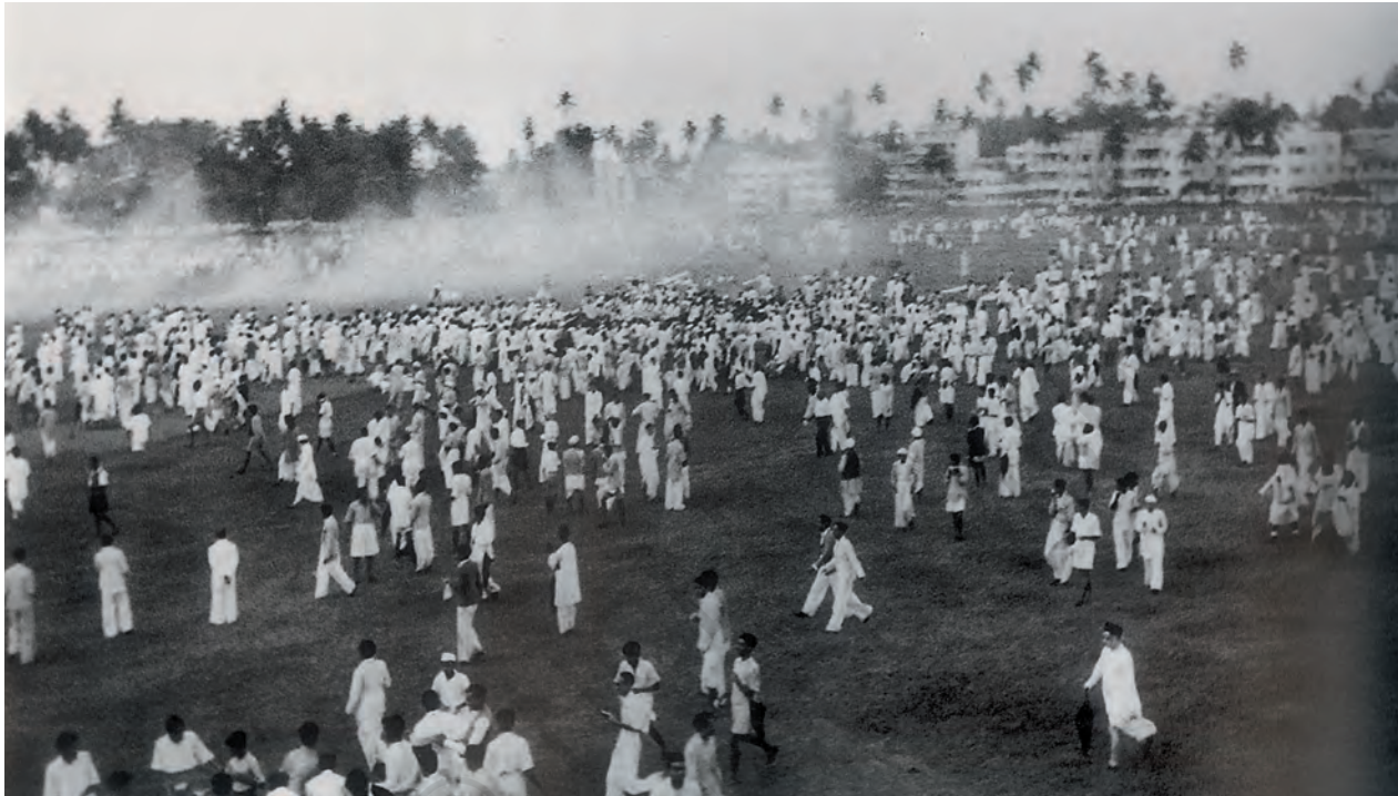
Fig. 1 – Police teargas demonstrators during the Quit India movement

In the previous chapters, we have looked at: