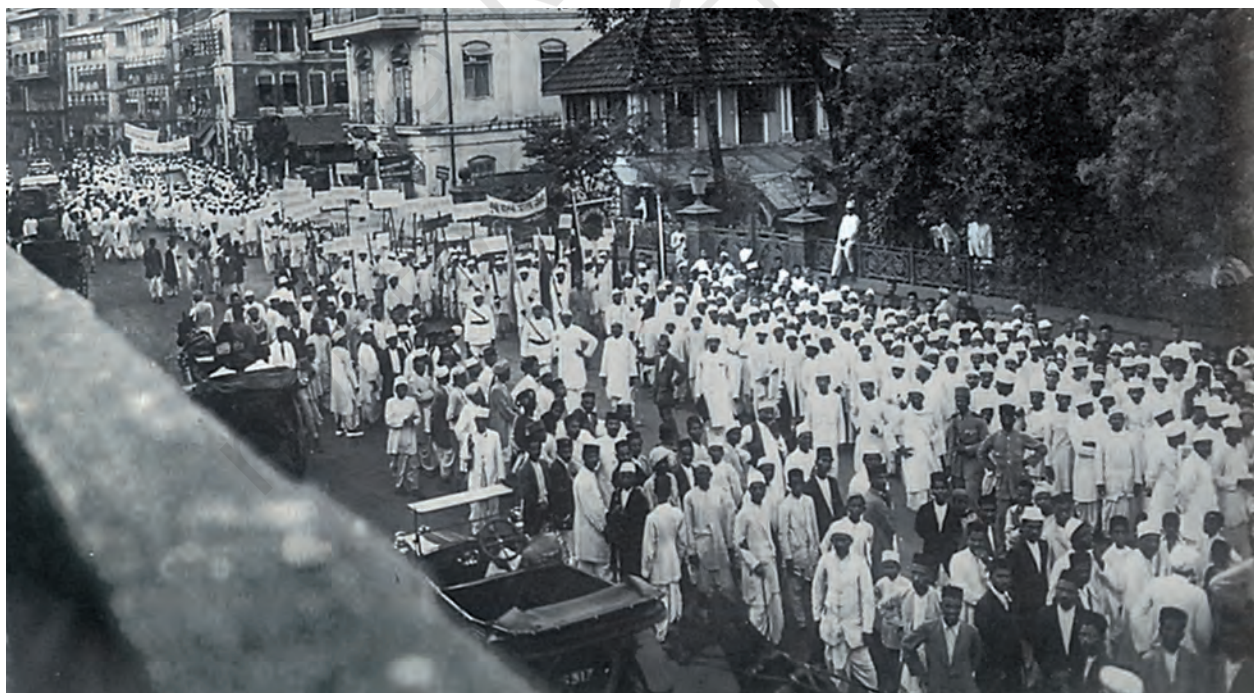
Fig. 4 – Thousands joined the demonstrations during the Swadeshi movement

Notice the name of the newspaper that lies on the table. Kesari , a Marathi newspaper edited by Tilak, became one of the strongest critics of British rule.