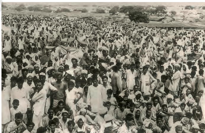
Fig. 22 – Refugees from riot-torn Punjab gather in New Delhi, in search of shelter and food

Also known as Badshah Khan, he was the founder of the Khudai Khidmatgars, a powerful non-violent movement among the Pathans of his province. Badshah Khan was strongly opposed to the Partition of India. He criticised his Congress colleagues for agreeing to the 1947 division.